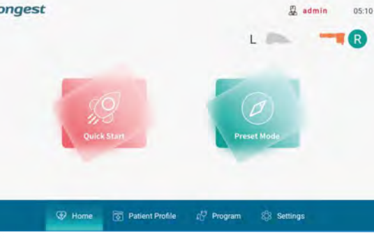
Large Full-Color Touchscreen